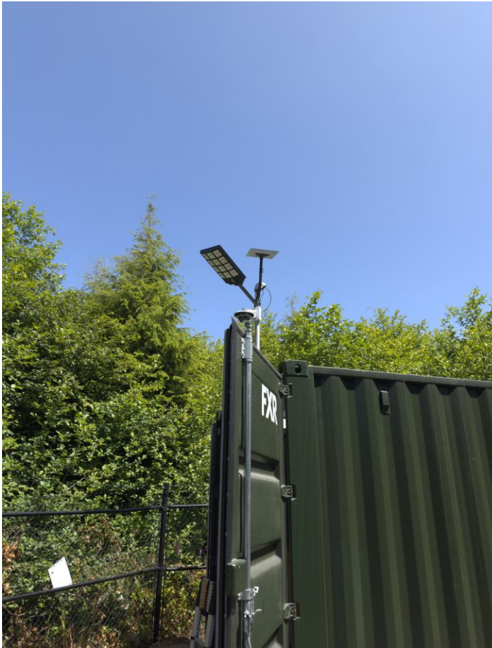
Starlink on the New CMCA Emergency Operations Center (Installed June 10, 2025)