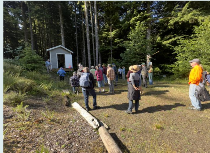
Ninth Street Tsunami Assembly Area (one of five in Cape Meares)