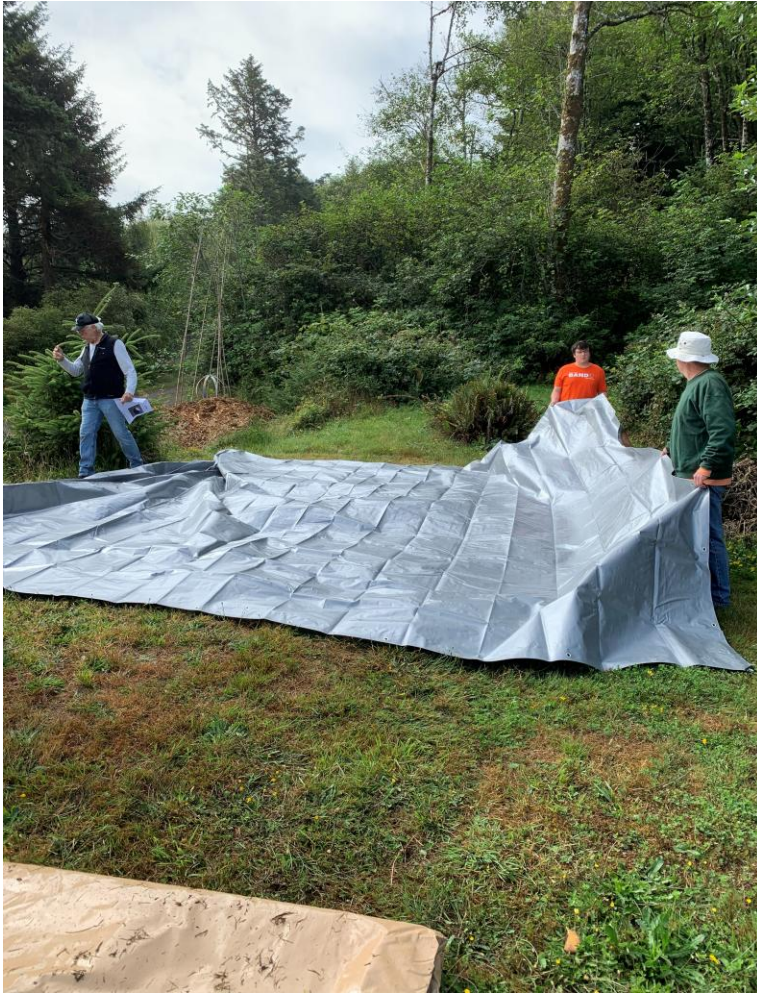
August 2024 Shelter Drill